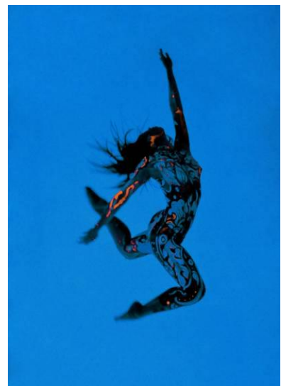
Revelation by Siras Nitithatsanakul, Multimedia performance, 2010

The Royal Thai Consulate General, New York